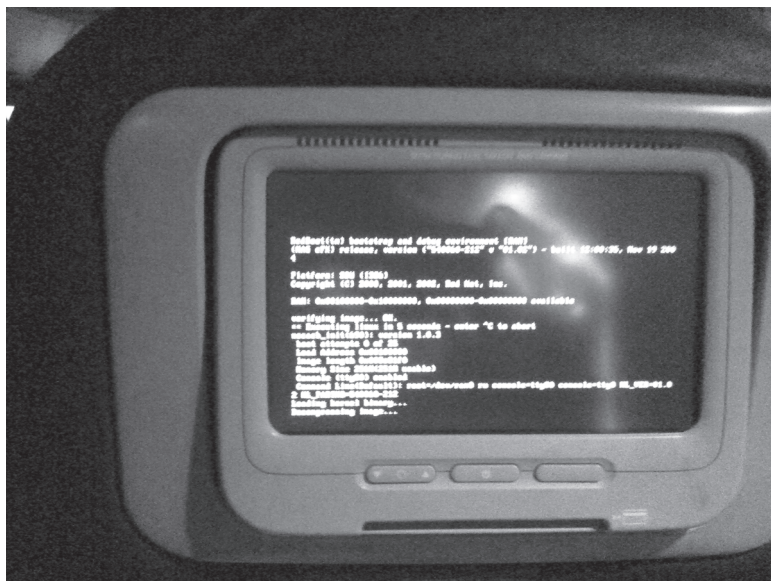
Figure 1.1. DOS Startup screen on an airplane.

Watching the plane chart its progress is ambient and relaxing as the beautiful renderings of oceanic plates and exotic names of small towns off the North Atlantic—Gander, Glace Bay, Carbonear—stream by.