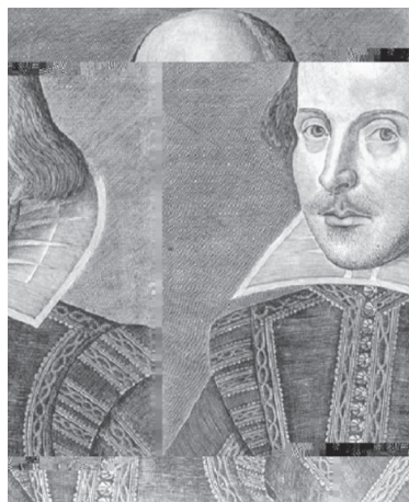
Figure 1.4. The Droeshout Engraving, after inserting text.

What we're experiencing for the first time is the ability of language to alter all media, be it images, video, music, or text, something that represents a break with tradition and charts the path for new uses of language. Words are active and affective in concrete ways. You could say that this isn't writing, and, in the traditional sense, you'd be right. But this is where things get interesting: we aren't hammering away on typewriters; instead—focused all day on powerful machines with infinite possibilities, connected to networks with a number of equally infinite possibilities—the writer's role is being significantly challenged, expanded, and updated.